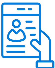
Job search help

Lead Scotland Linking education and disability